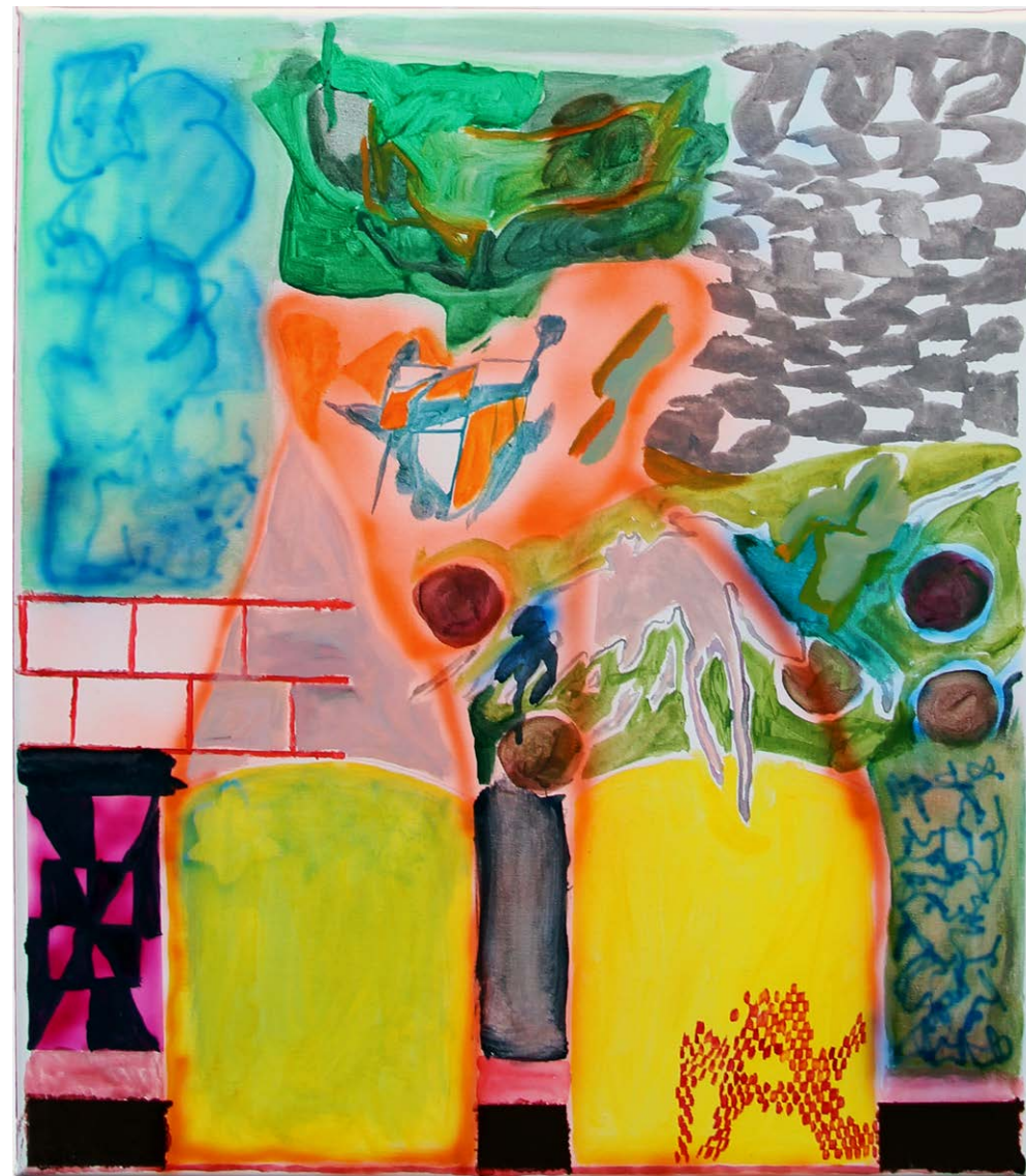
House Acrylic & flashe on polycotton 61 x 50.8cm

Bikes, cars, lawnmowers, whipper snippers, trailers, pot plants, barbecues, hubcaps, and exercise equipment; perfectly good plastic crates and wooden boxes, window frames and old doors, and fridges full of drinks; clotheshorses, towels, underwear, pants, shirts, sheets; gumboots, thongs, bags of old rags, jigsaws, table saws, and one-handed saws; rulers, pencils, porno mags, old CRT TVs, and easels; fairy lights and the trees they're hung on, front gates, and mailboxes; weatherboards, bricks, corrugated tin sheeting, hinges, nails, and screws; grass, crickets, soil, soil with a good pH level and beneath it those root systems intermingled underground, wrapped round concrete foundations and wheedling their way through the cracks and inside, eating slowly away at the underside of every house in the neighbourhood; hills hoists, herb gardens, and plastic tricycles; the fruit and berries from branches, the dew on them before dawn, the wiring round the garden bed meant to keep the possums out but easy enough to pull to one side, to reach in, to take a small and newly bloomed flower home, just one of many, just one, so small that no one will notice.