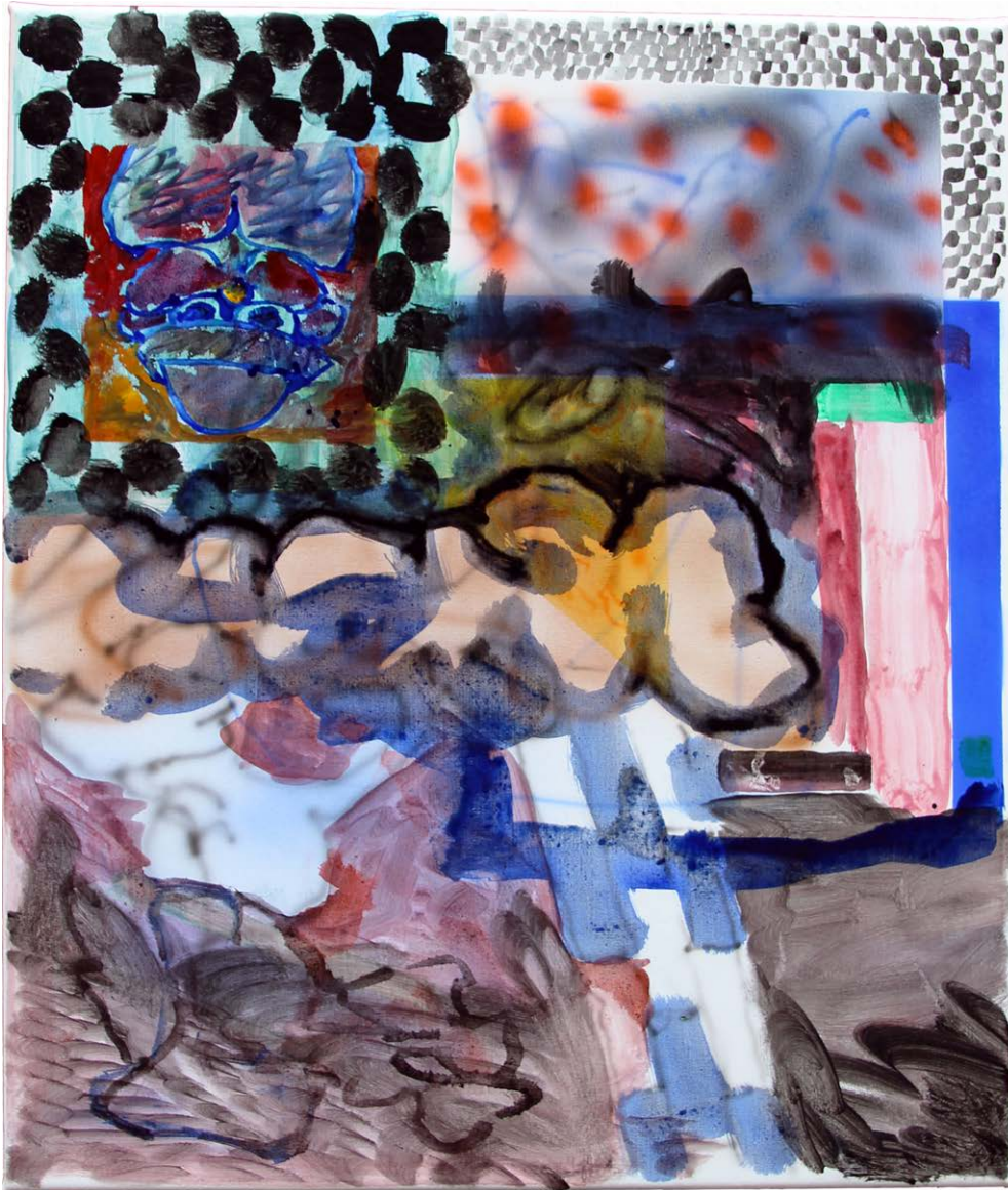
Blocks Acrylic & flashe on polycotton 61 x 50.8cm