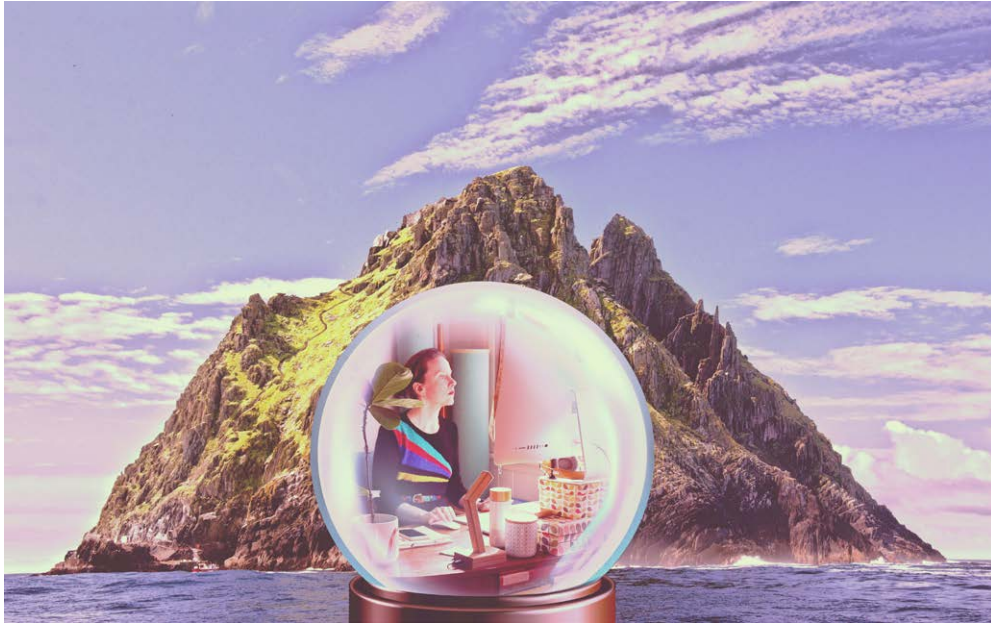
Isolation Vacation: Not near an Island Digital print 42 x 26cm