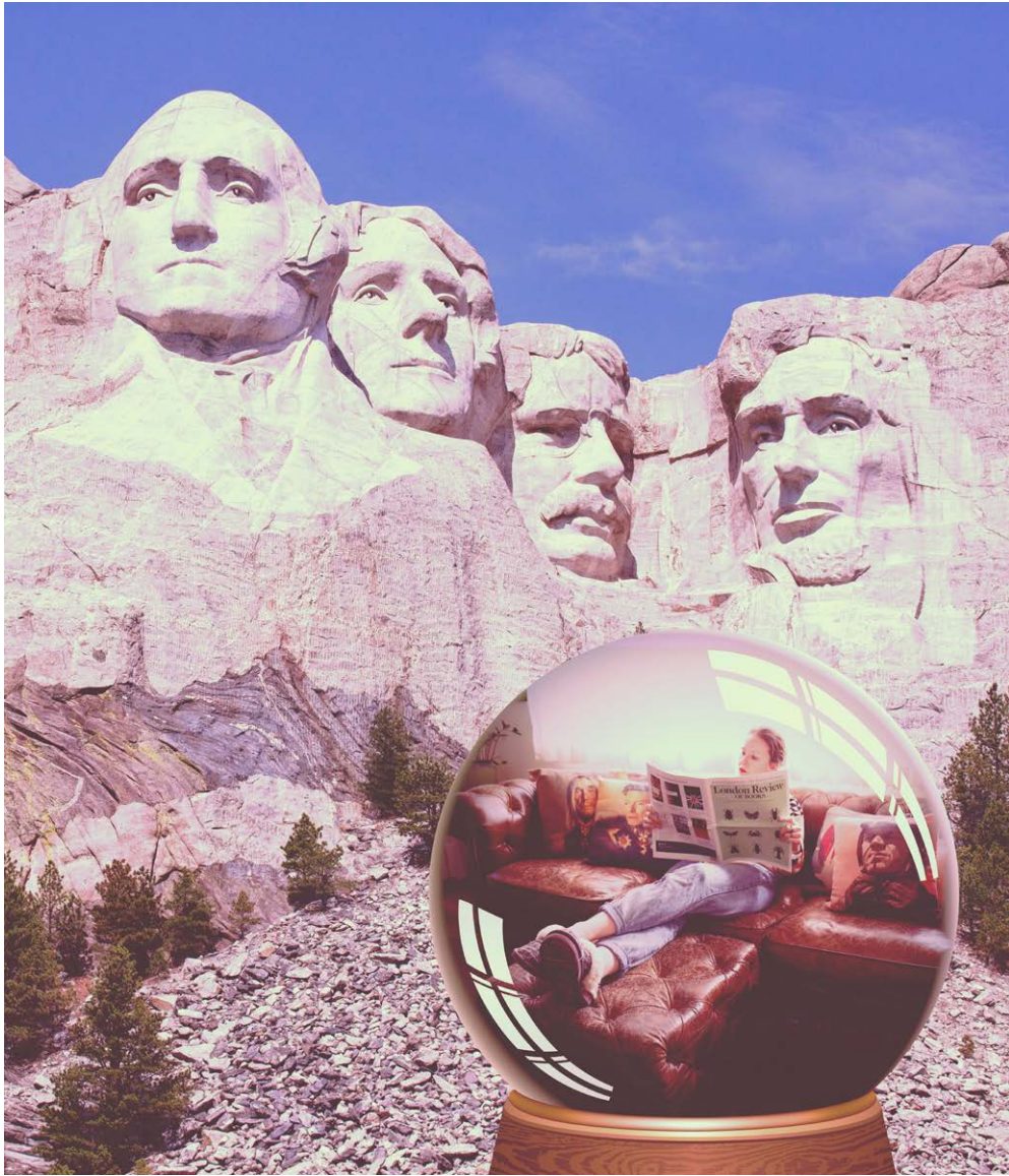
Isolation Vacation: Not at a Monument Digital print 49 x 57cm