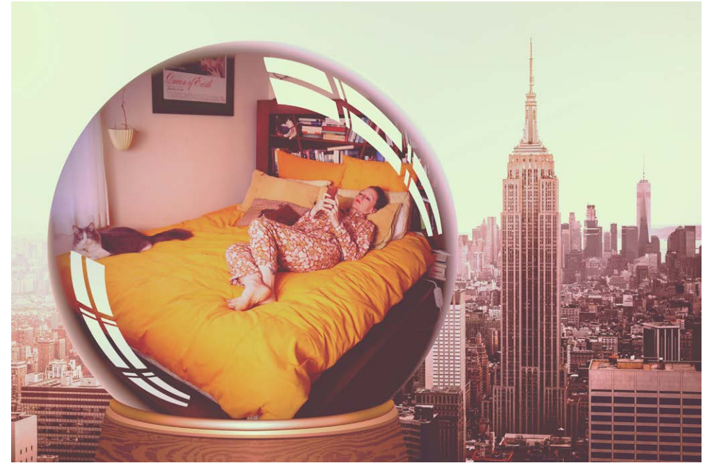
Isolation Vacation: Not in a World City Digital print 45 x 40cm

Been putting off writing that book? Now's the time to let those creative juices come gushing out of you! Dig out that half-finished family memoir about the time your Auntie Bev lived next door to a serial killer and once had a full five-minute conversation with him about the local property market; dust off that Veep meets MacGyver TV fantasy script about a crime-fighting vice-president who believes in science. Remember: literally tens of people on the internet are dying to know about your daily word count and all the other amazing creative projects you've completed during lockdown! Don't disappoint them, or yourself!